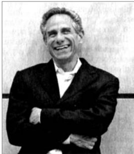
Eric Owen Moss