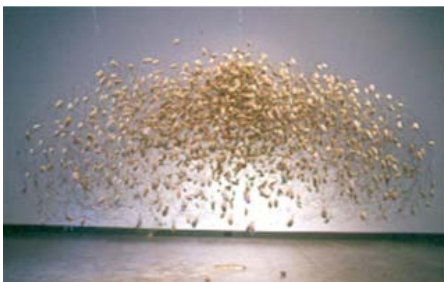
Yuriko Yamaguchi Web #5 2003 abaca, wire, flax

Invitational Exhibition of Painting and Sculpture Thursday, March 9 through Sunday, April 9, 2006 Thursday -Sunday 1 p.m. to 4 p.m. Admission Free Audubon Terrace, Broadway between 155 th & 156 th St. Subway: Broadway # 1 to 157 th Street. Bus: M4, M5 to 155th Street & Broadway