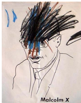
Glenn Ligon Small Malcolm X , 2003 silkscreen and oilstick on canvas