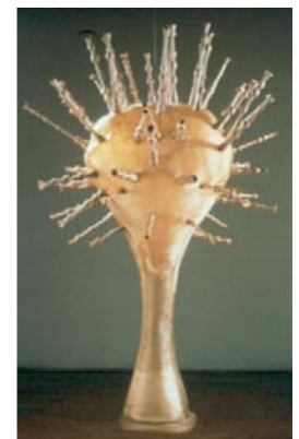
Dean Snyder Joop , 2001 rawhide and turned wood