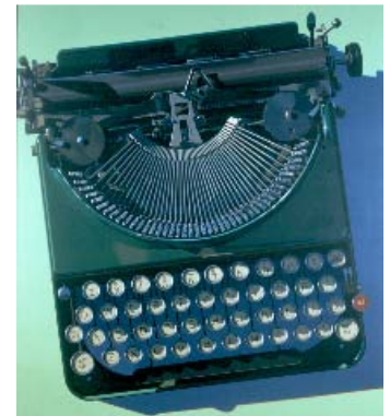
Robert Cottingham Jane's Remington 2002 Oil on canvas 84 x 74 inches