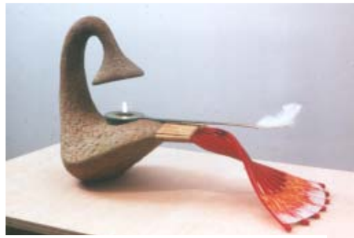
John Newman Feather, Fan and Flame 2003 Cast, forged and fabricated patinated bronze, oil lamp, bamboo, painted wood, chalk, pencil, gouache on paper 14 x 10 x 23 inches