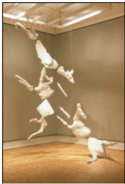
Gillian Jagger White Doe with Twins 2002 Plaster, wood, wire 154 x 84 x 84 inches

February 4, 2005 - Work by 32 contemporary artists will be on view at the American Academy of Arts and Letters galleries on historic Audubon Terrace (Broadway between 155 and 156 Streets) from Thursday, March 10, through Sunday, April 10, 2005. The gallery will be closed on March 27, Easter Sunday. The exhibition will feature the art of 20 painters, one photographer, and 11 sculptors. Site-specific installations by six of these artists will be created especially for the show. The finalists were chosen from a pool of more than 150 contemporary artists nominated by the members of the Academy, one of America's most prestigious societies of architects, artists, writers, and composers. Work on view at the Academy will be eligible for $200,000 in cash prizes and purchases.